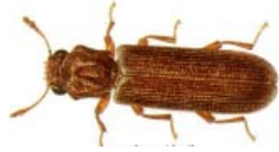
Powder Post Beetles