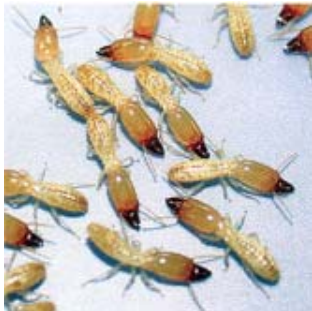
Native Subterranean Termites