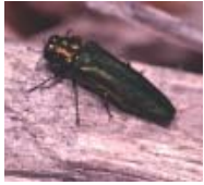
Wood Boring Beetles