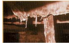
Wood Decaying Fungus